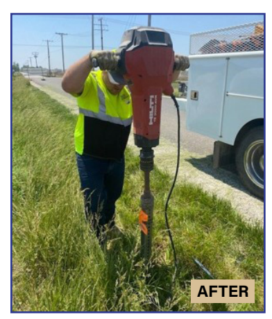
sign truck build so the unit can be powered, stored, and safely used when on the jobsite